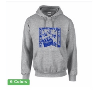
SPIRIT NIGHT 2021 Hoodie $25.00