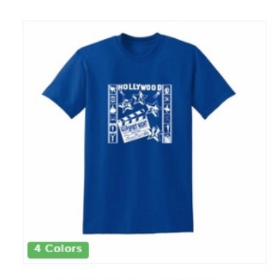
SPIRIT NIGHT 2021 T-Shirt $10.00

Please take a look at all of the items available to show your CEC SPIRIT NIGHT and TEAM Pride! Please don't delay - the store is open for 1 week in order to have delivery by Spirit Night and closes Tuesday, March 30 at midnight. Late orders cannot be accepted as they stall timely orders.