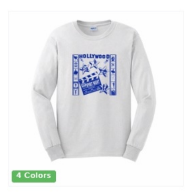
SPIRIT NIGHT 2021 Long Sleeve T-Shirt $15.00